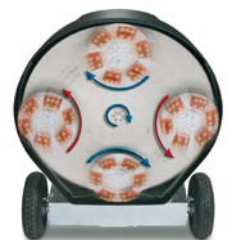
A and B versions are necessary for HDX models.